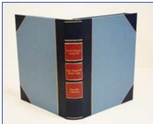
The titling and tooling of clamshell boxes, such as the one above, will be discussed as part of class.